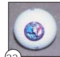
SPFPA Logo Golf Balls