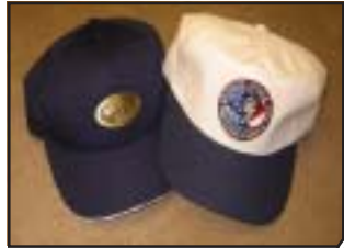
SPFPA Hats Medallion (Navy) Embroidered (White, Black, Navy)