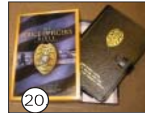
SPFPA Police Bible