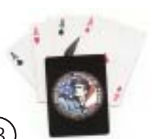
SPFPA Playing Cards