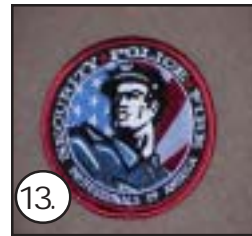
SPFPA Embroidered Patch