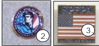
SPFPA Lapel Pins