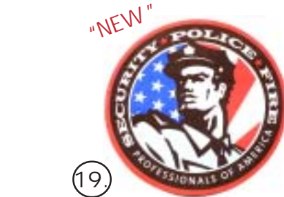
SPFPA Mouse Pad