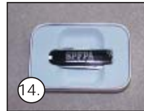
SPFPA Swiss Army Knife (Black)