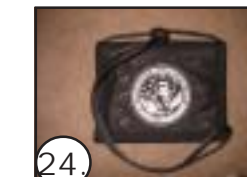
SPFPA Neck Wallet