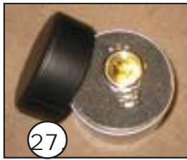
SPFPA Deluxe Watch (Black Dial)