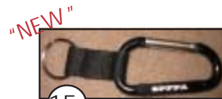
SPFPA Key Rings