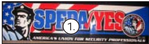
SPFPA Bumper Sticker