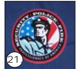
SPFPA Round Sticker