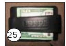
SPFPA Leather Travel Wallet